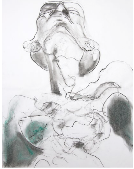
Arghaël: Life Force–Breathe, charcoal and pastel on paper, 65 x 65 cm, 2015