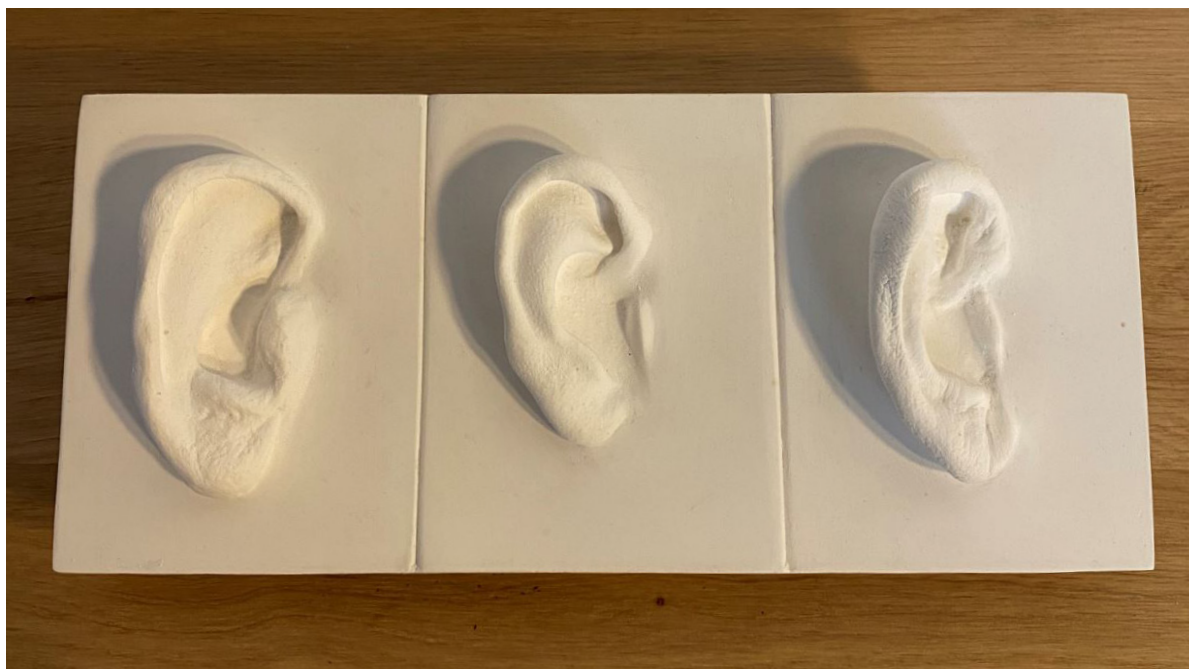
Oreilles (Trois) (2017) Marble plaster 23,5 x 10,5 x 1 cm 330 euros