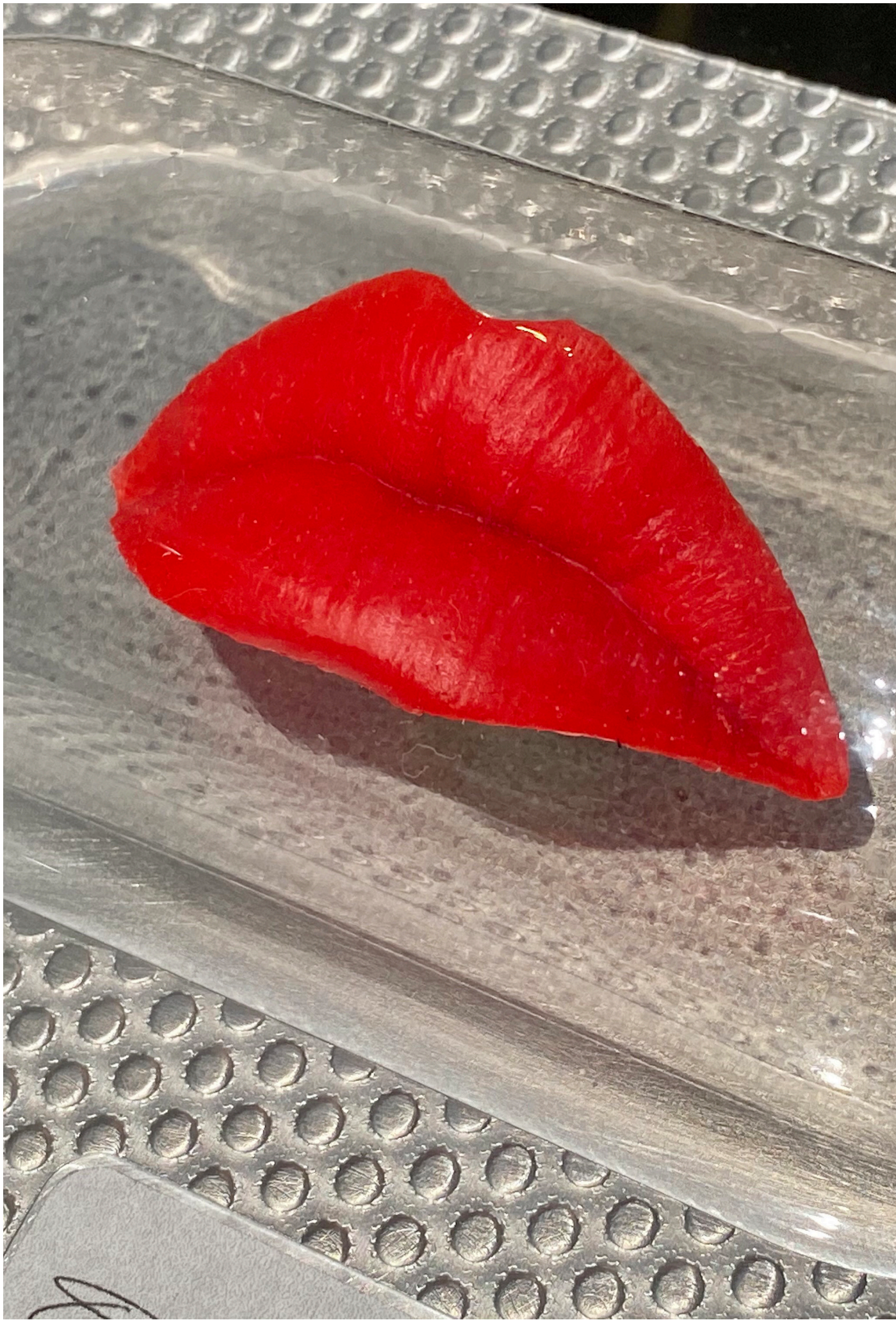
Blister (detail), 2018, Silicon, plexi, metal, 18 x 11 x 3 cm