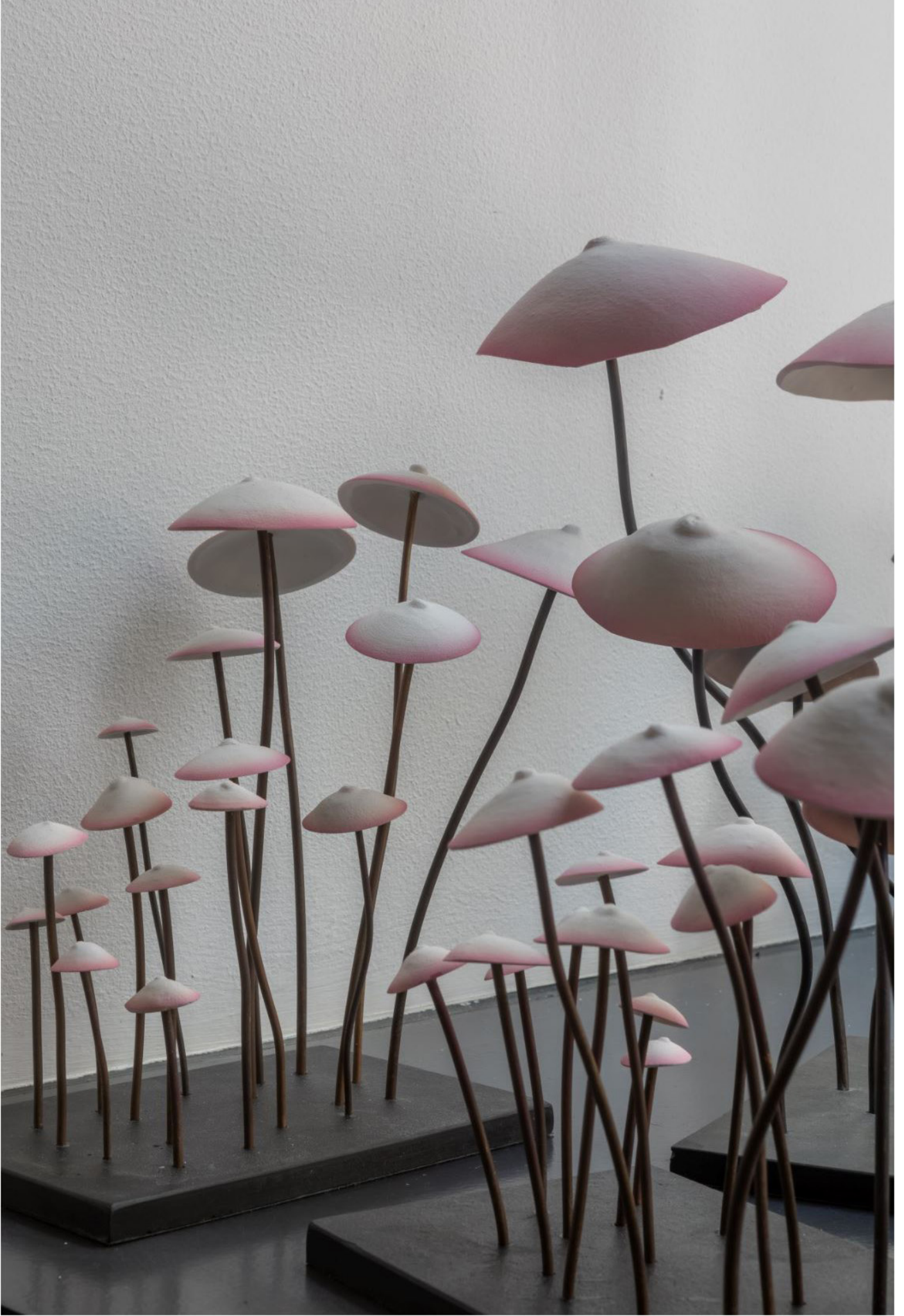
View of the exhibition Find Yourself, Loo and Lou Gallery — Haut Marais, 2020