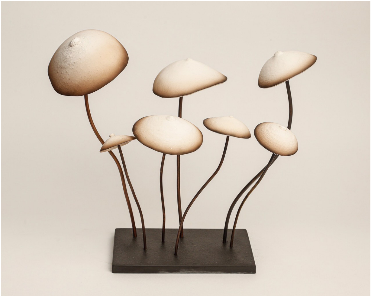
Breast pépinière marron (2020)