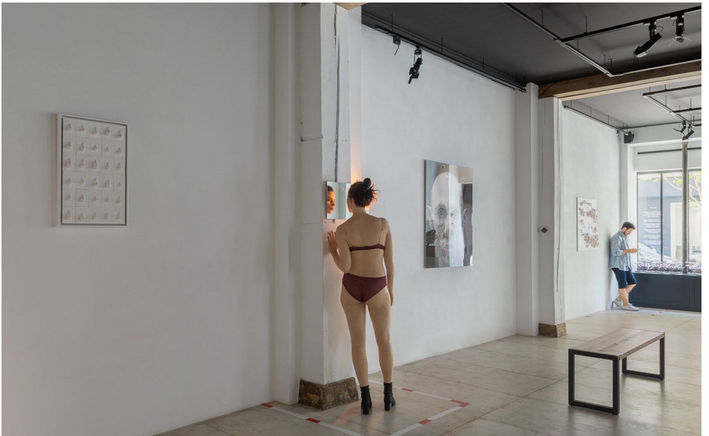
Views of the exhibition Find Yourself , Loo & Lou Gallery - Haut Marais, 2020