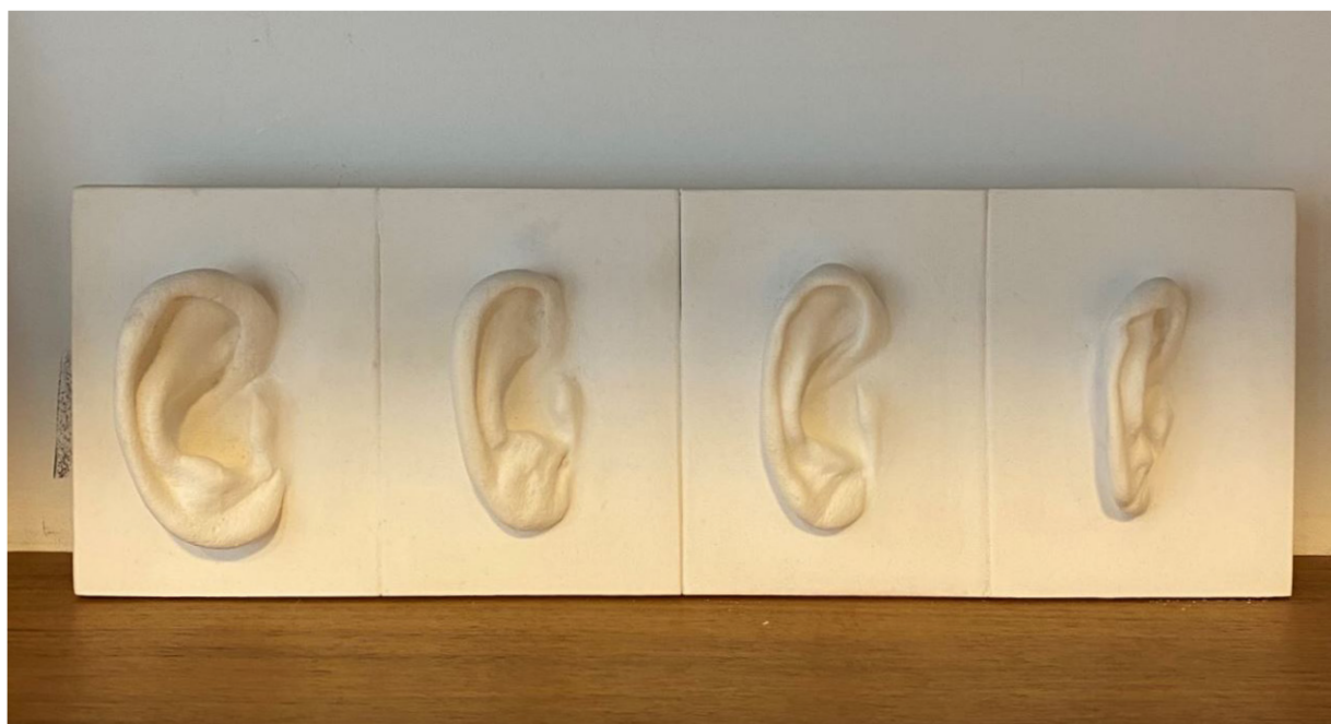
Oreilles (Quatre) (2017)

Marble plaster 31,5 x 10,5 x 1 cm 440 euros