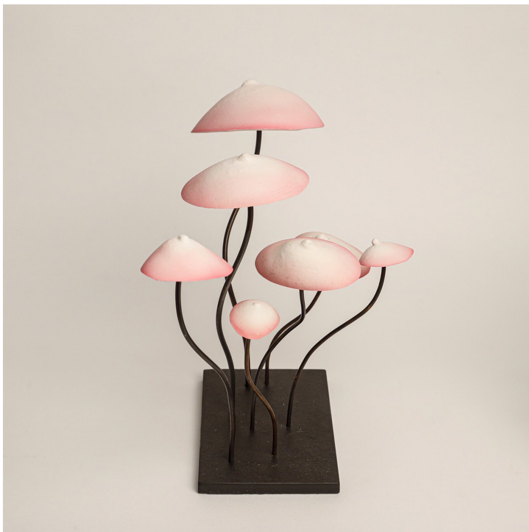
Breast pépinière rose (2020)