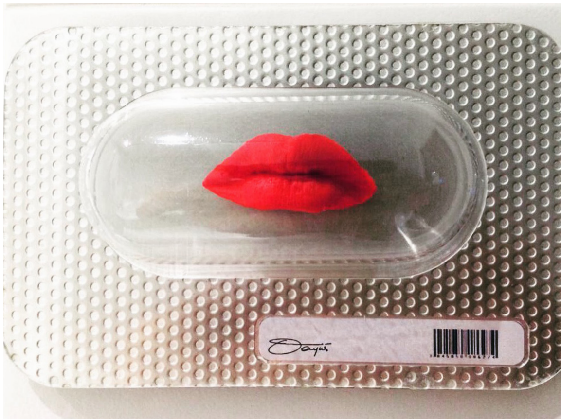
Blister (2018) Silicon, plexi, metal 18 x 11 x 3 cm 990 euros