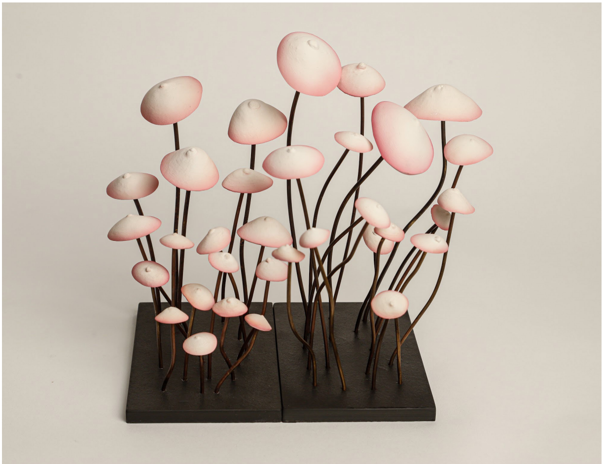
Breast pépinières roses (2020) 16 mushrooms (two works displayed) Marble plaster, metal, slate 31 x 20 x 16 cm 1 540 euros each