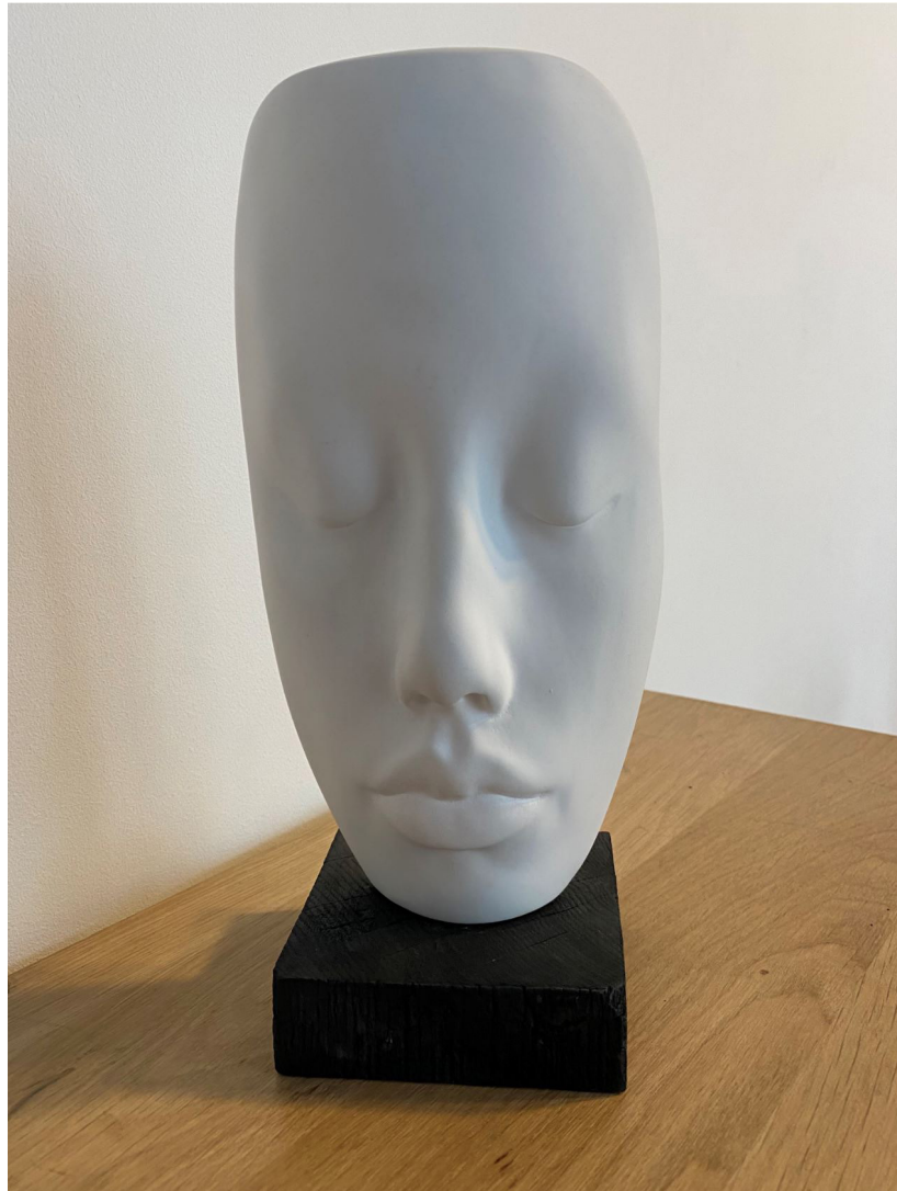
Léa (2016) Jesmonite, burnt wood base 12 x 26 x 10 cm 990 euros